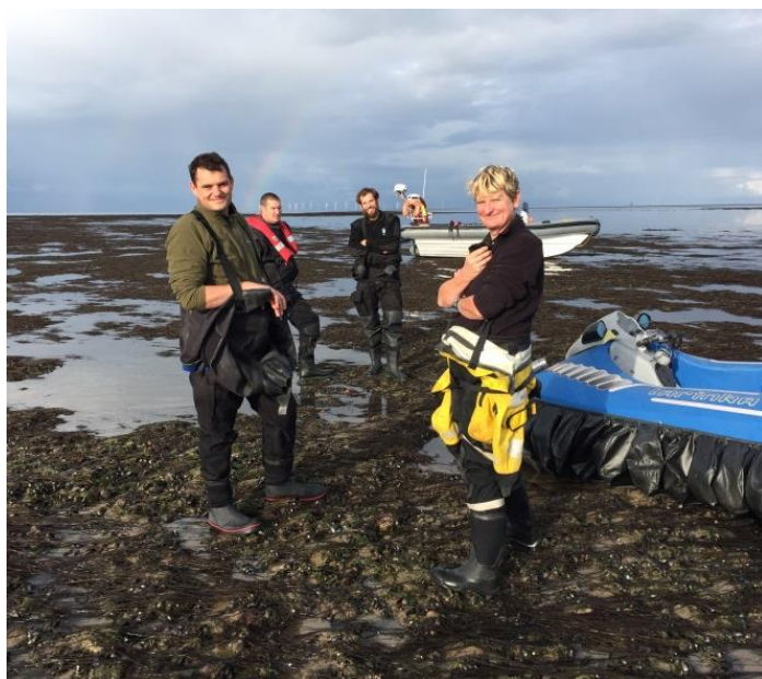
Figure 2: NWIFCA uses ribs and quad bikes to reach remote mussel beds in Morecambe Bay before carrying out surveys and inspections on foot

Designated MPAs cover a large amount of the District. These include four Marine Conservation Zones (MCZ), five Special Areas of Conservation (SAC), three Special Protections Areas (SPA), and three proposed SPA extensions. There are also Ramsar sites, national and local nature reserves and Sites of Special Scientific Interest (SSSI) within the intertidal and coastal zones.