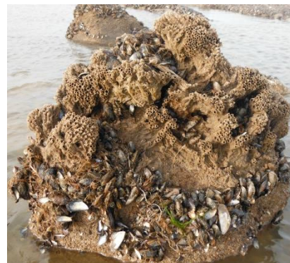
Figure 4: Sabellaria alveolata reef

NWIFCA Byelaw 6 1 : PROTECTION FOR EUROPEAN MARINE SITE FEATURES (2014) protects reef features within the Morecambe Bay, Solway Firth, Dee Estuary, Shell Flat and Lune Deep EMS from bottom towed gear. The byelaw also prohibits bait collection and fishing by hand in the seagrass beds of Morecambe Bay.