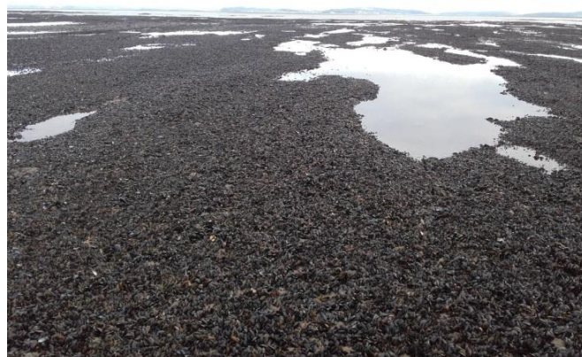
Figure 1: Glacial moraine skewer in Morecambe Bay covered in seed mussel

The NWIFCA District contains a range of sensitive habitats ranging from deep, species rich, offshore mud to rocky shores along the Cumbrian Coast with important nesting sites for seabirds. There are vast expanses of intertidal and sub-tidal sandbanks adjoining extensive bays and estuaries. Intertidal glacial cobble and boulder moraine skears typically have substantial honeycomb worm reefs. The mussel beds of Morecambe Bay, the Ribble Estuary and other areas are economically important and are the focus of much of the management work of the Authority.