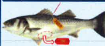
Above: Example of fine-scale depth & temperature profile from a returned seabass implanted with an electronic tag.