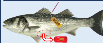
Above: Example of fine-scale depth & temperature profile from a returned seabass implanted with an electronic tag.

For more information email us your details to sbfc@cefass.co.uk to be added to the mailing list or follow us on Twitter @CefasGovUK