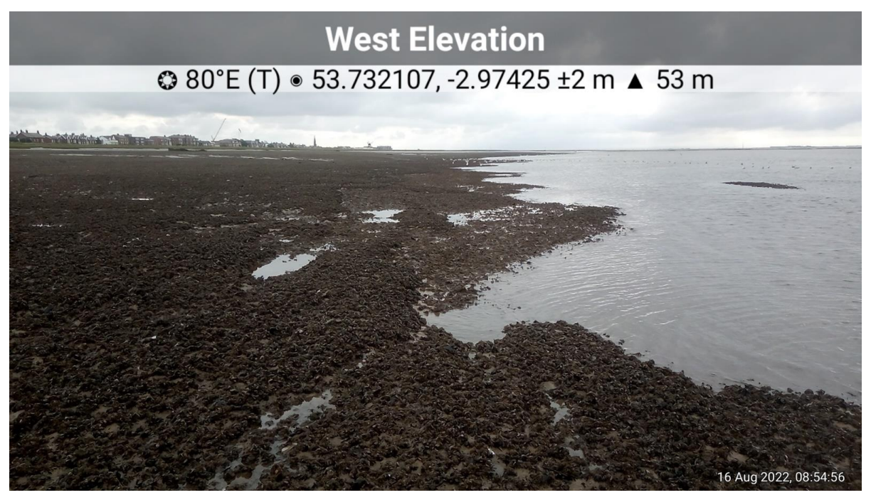
Fig 2. Strip of mussel along the channel edge of the River Ribble 16-08-22