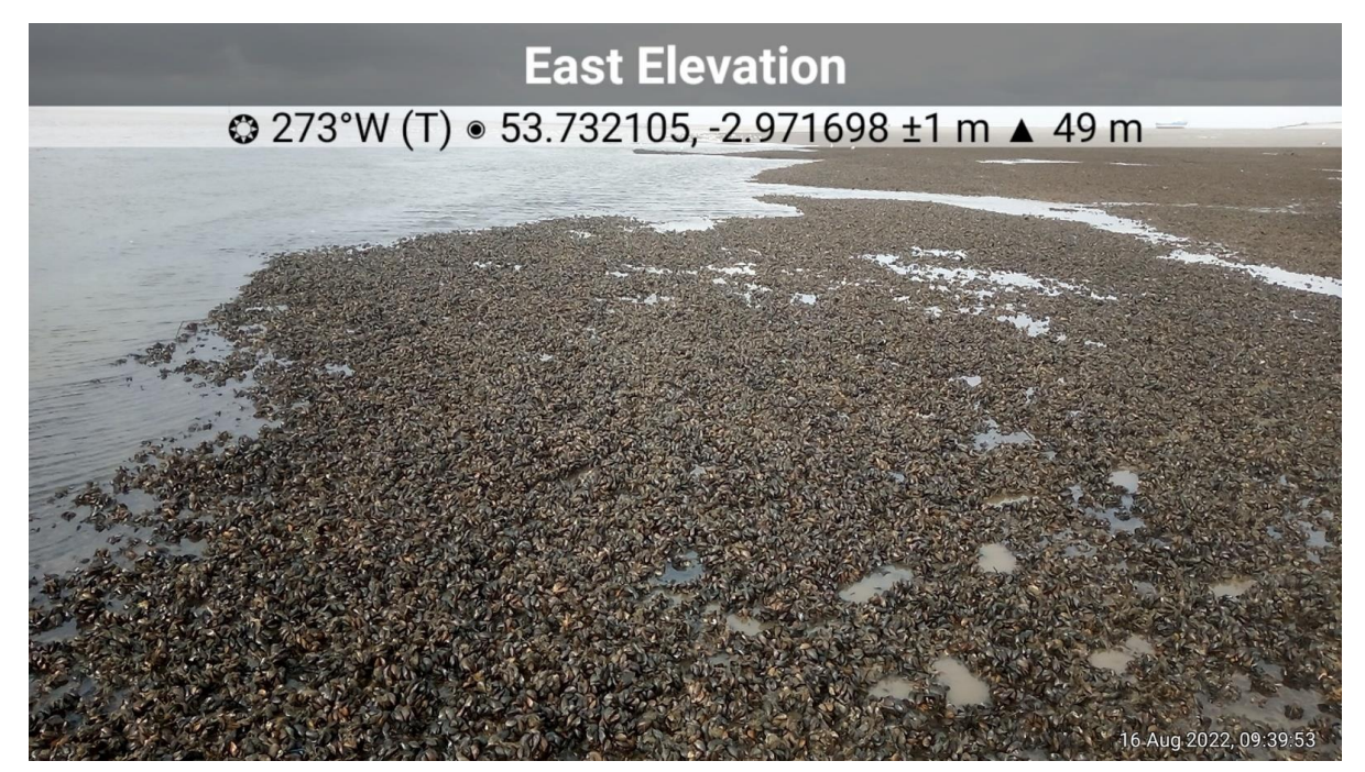
Fig 4. Area of 30-40mm mussel with very little 5-8mm seed mixed in 16-08-22