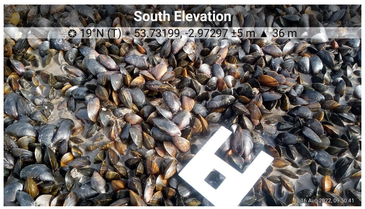
Fig 5. Clean 30-40mm mussel on small island on the channel edge 16-08-22