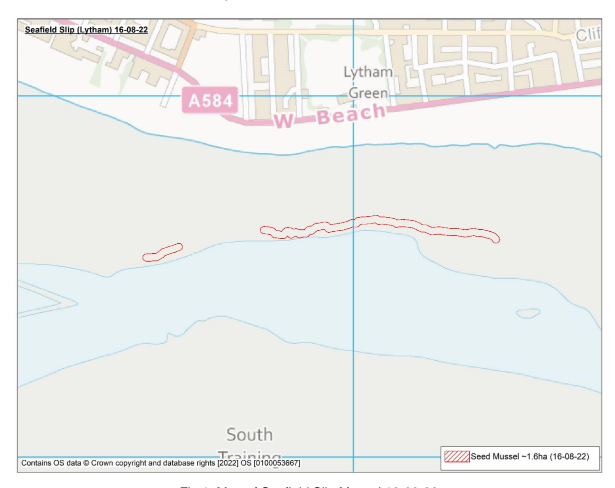
Fig 1. Map of Seafield Slip Mussel 16-08-22

The mussel is in a thin strip approximately 20m wide along the channel edge of the River Ribble, consisting of two areas totalling 750m long (Figures 1 and 2). The mussel consisted mainly of two size classes, newly settled seed, 5-8mm in length and larger seed, 30-40mm in length (Figure 3). The small seed was higher up the shore line, with a mix of 5-8mm and 30-40mm in near the channel edge. At low tide there are a number of small islands (10m²) that contain clean 30-40mm (Figures 4 and 5). There was the occasional large barnacled size mussel mixed in with the seed (Figure 6). Higher up the shore the mussel was on hard substrate with a very thin layer of settlement underneath. Towards the channel edge the mussel was on mud with some signs of scour of the mussel still under the water at low tide.