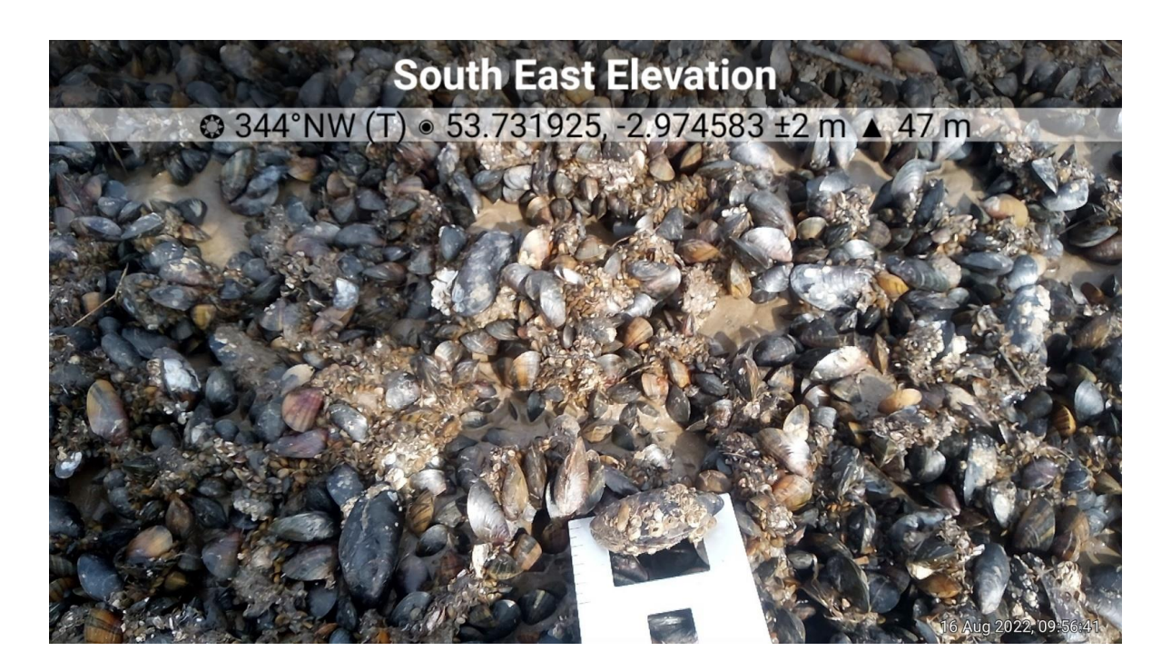
Fig 9. Area with occasional larger old mussel mixed in 16-08-22